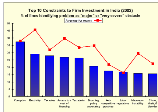
Enterprise Survey Perception Rankings